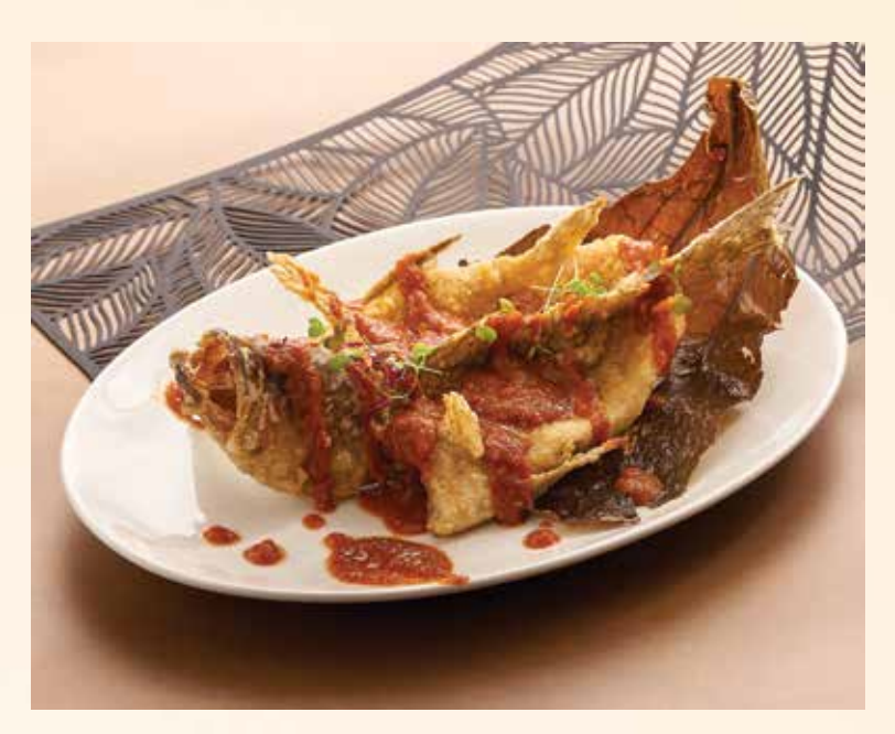
38.炸石斑鱼 Fried Grouper