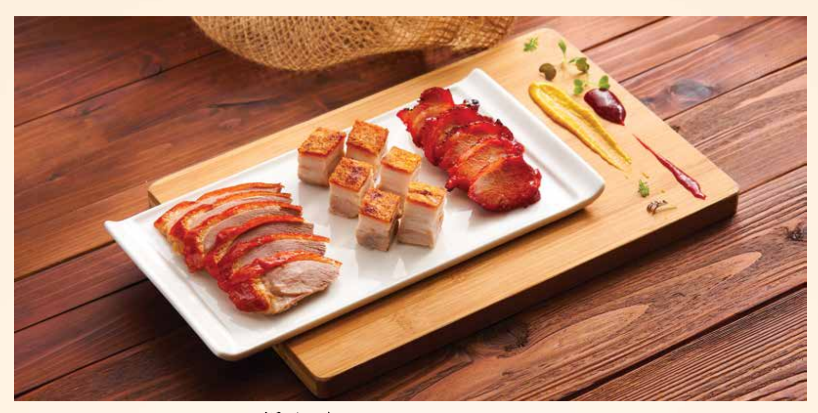
三拼烧味 3 Combination H.K Roast