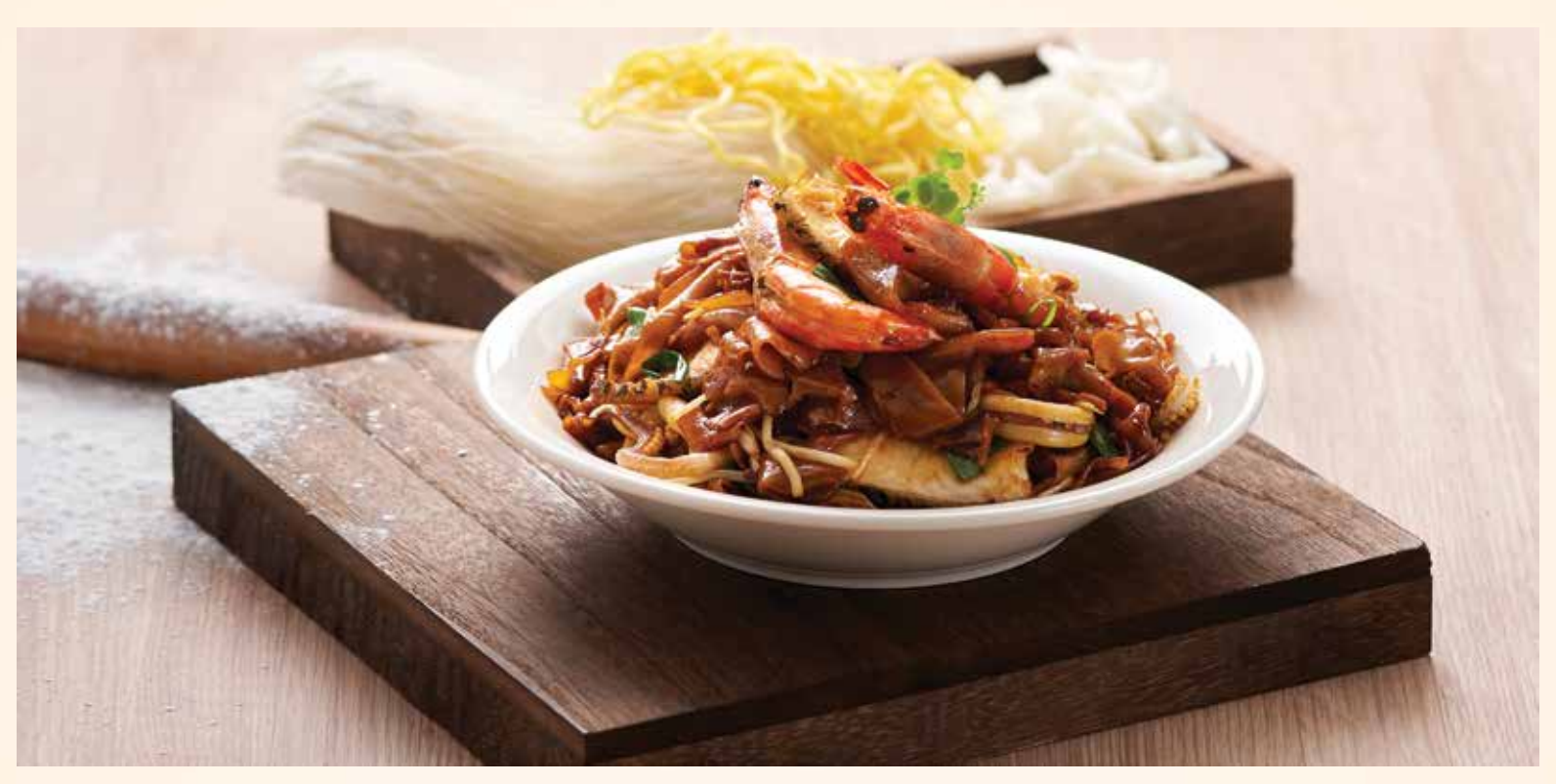
68. 千炒海鲜河粉 $13.80 Wok Fried Dry Hor Fun w/ Seafood