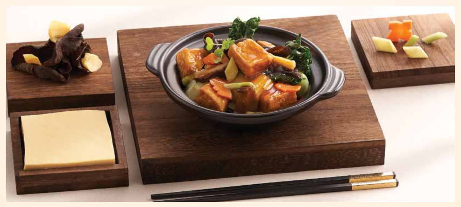
50.砂锅豆腐罗汉斋 Claypot Tofu 'Luo Han Chye'