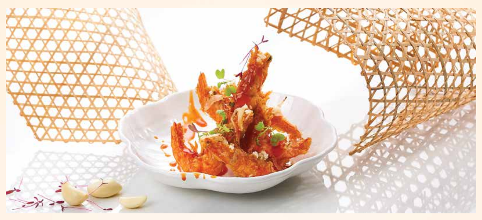
57.虾 Whole Prawn