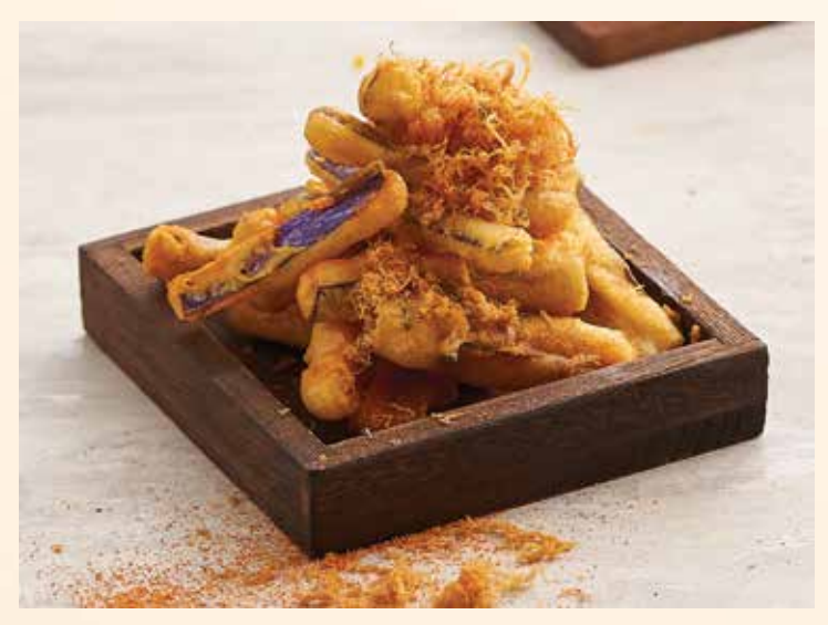
17. 肉松炸茄子 Fried Eggplant w/ Pork Floss

16. 咸蛋金瓜片 $8.80 Fried Pumpkin w/ Salted Egg