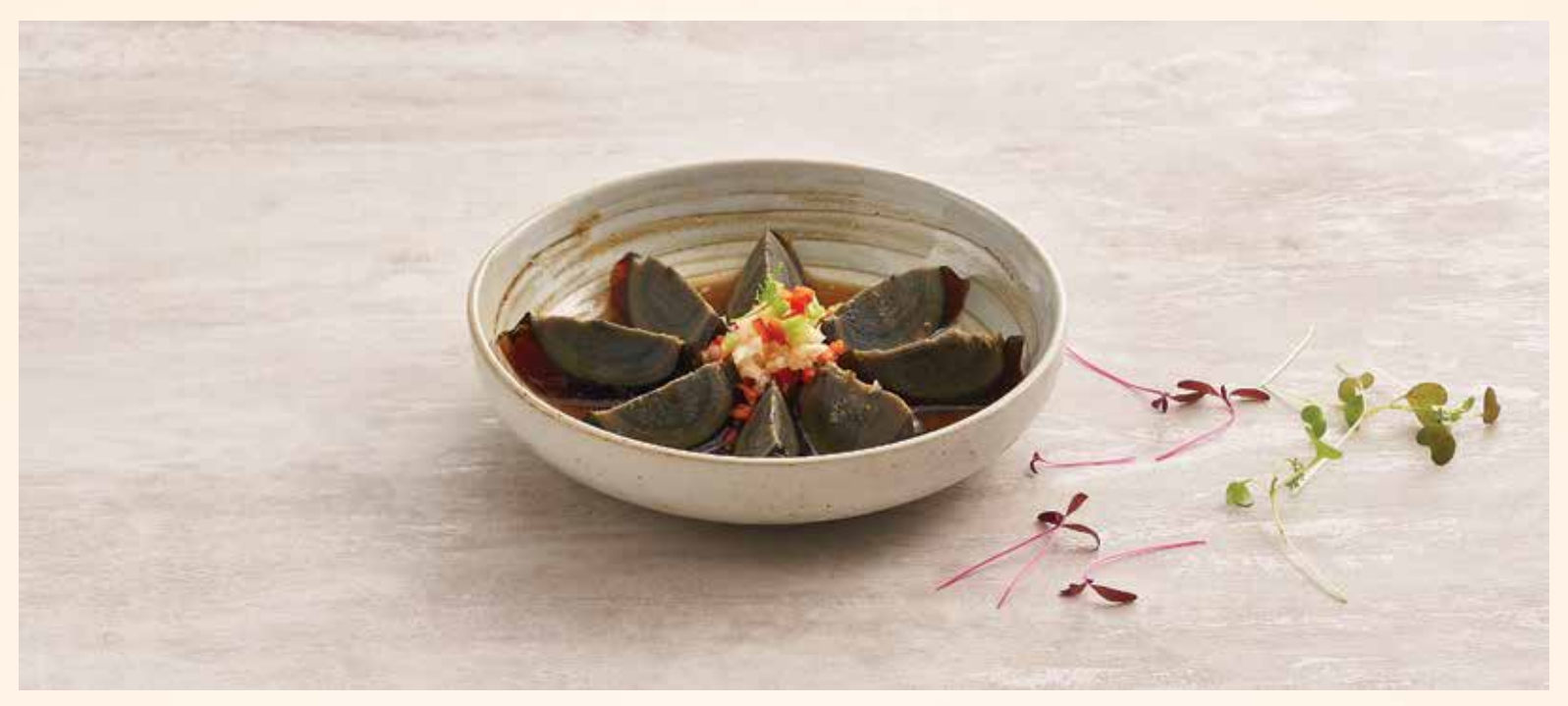
10. 蒜蓉皮蛋 $5.80 Century Egg w/ Garlic Chilli Vinaigrette