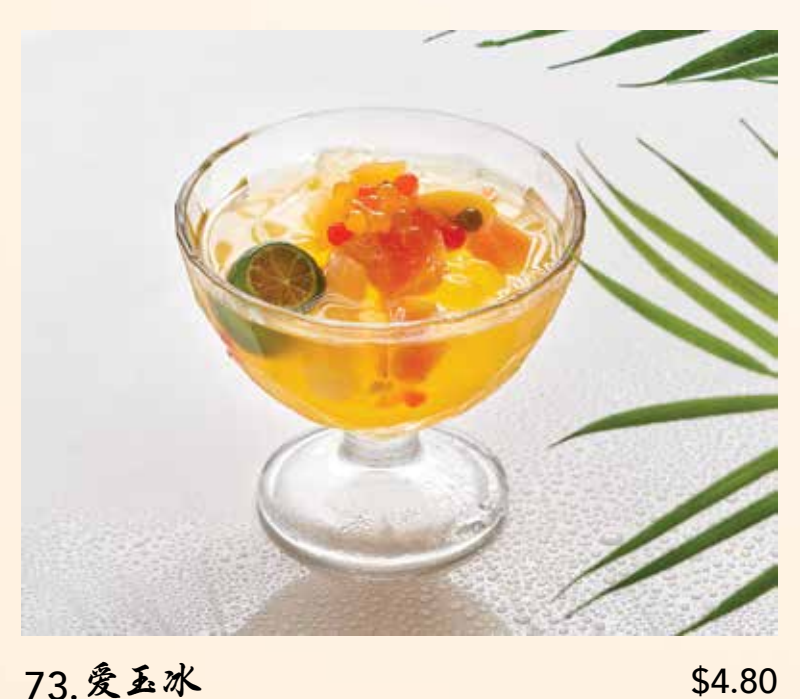
73. 爱玉冰 Ice Jelly w/ Honey Lime