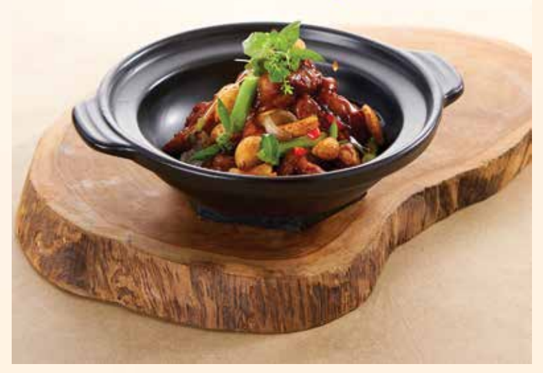
34. 三杯鸡 Three Cup Chicken 'San Bei'