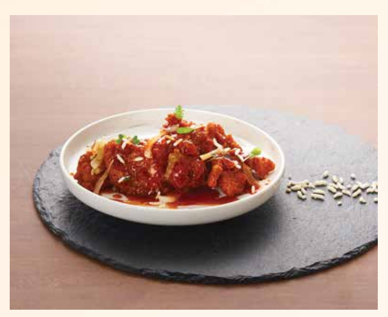
26. 招牌排骨 Pork Ribs in Signature Sauce