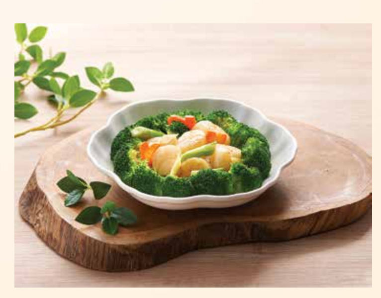
55. 西兰花炒带子 Sautéed Brocolli w/ Scallop