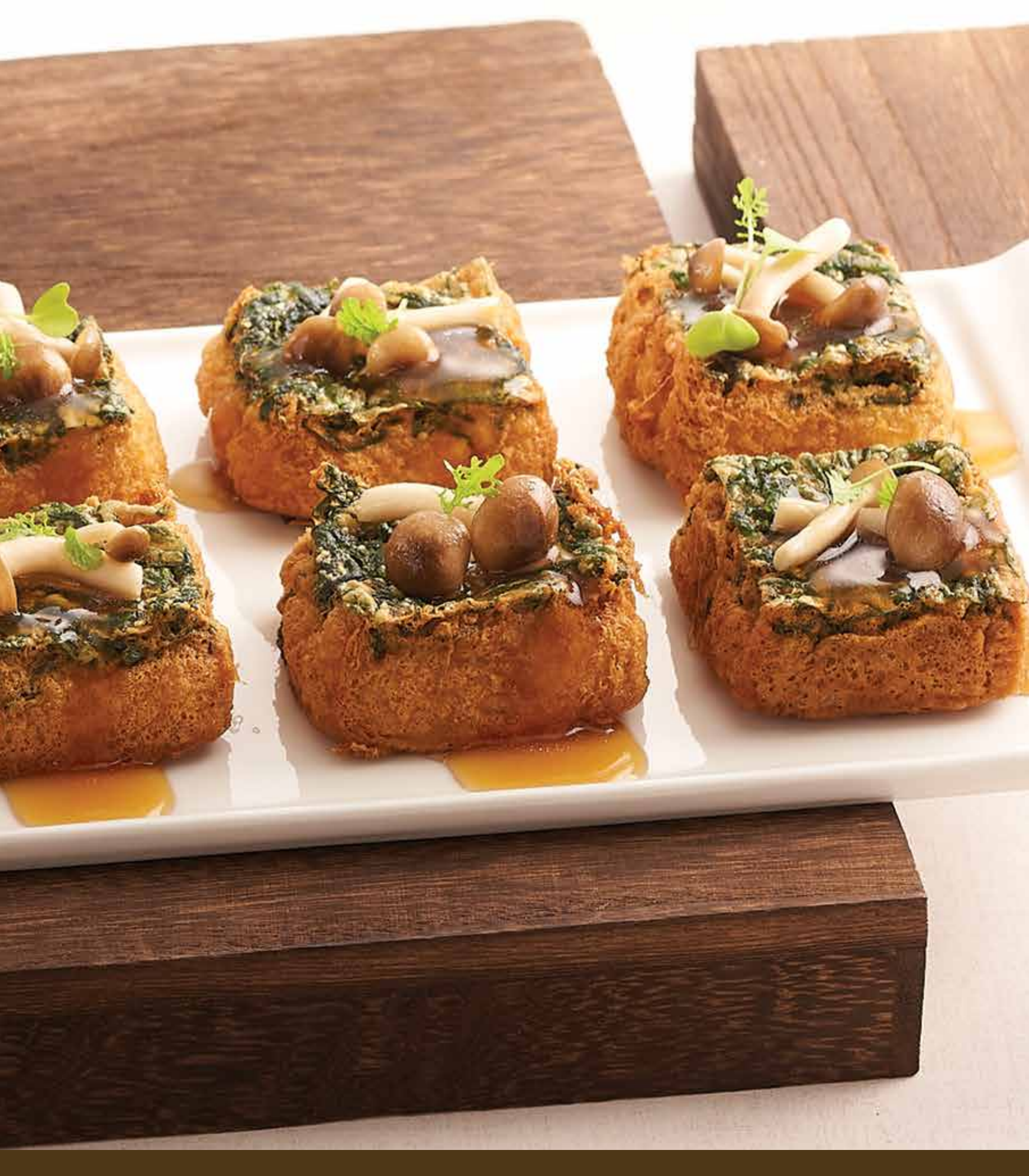
48. 菠菜豆腐 $16.80 Handmade Spinach Tofu w/ Mushrooms