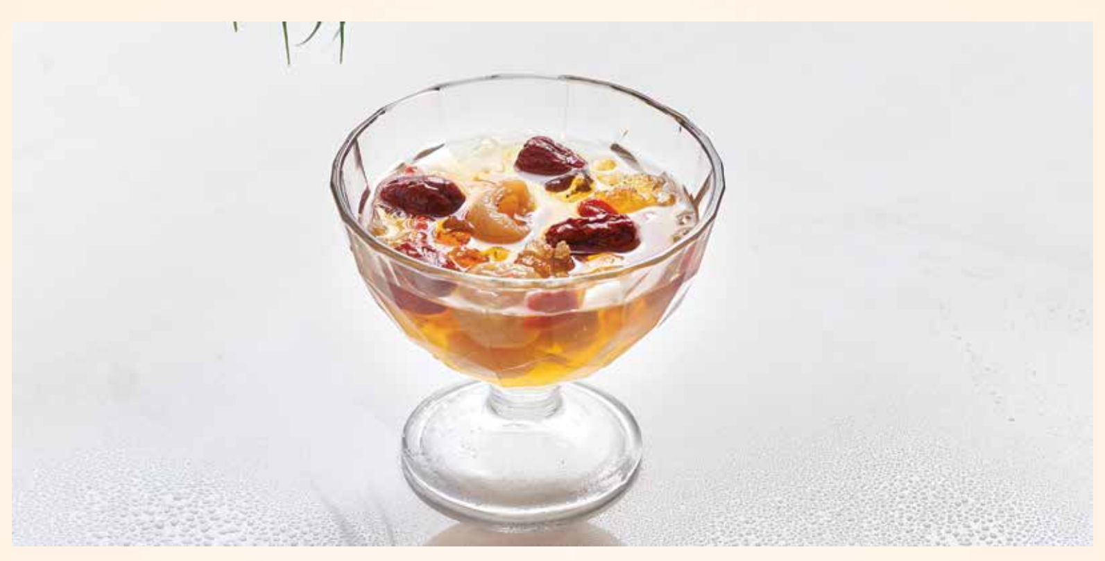
72. 桃胶龙眼红枣 Peach Gum w/ Red Dates & Longan