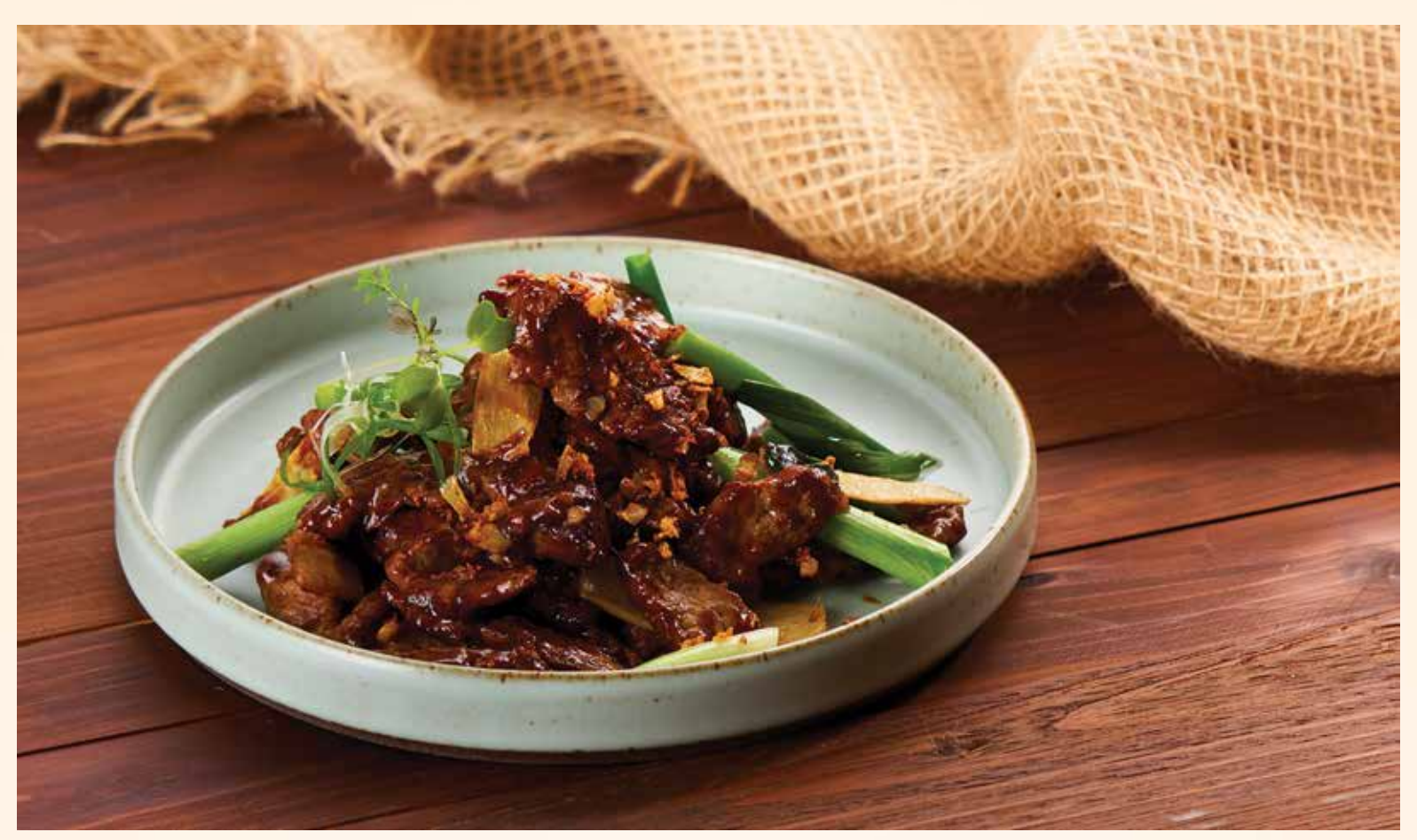
35. 姜葱炒鹿肉 $18.80 Venison Stir Fried w/ Ginger & Spring Onion