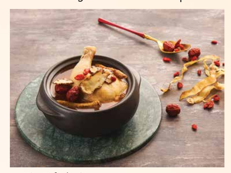
4. 老火帝皇鸡汤 Imperial Chicken Soup