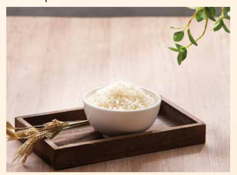
66. 自饭 $1.50 White Rice