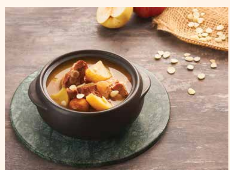
6. 老火苹果雪梨汤 Apple Snow Pear Soup