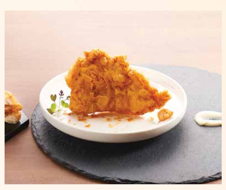
28. 脆皮肉扒 Signature Crispy Pork Chop