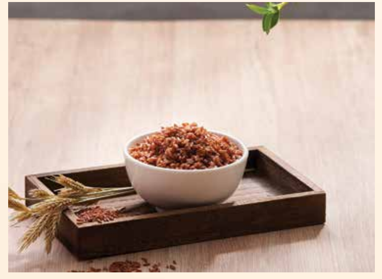
65. 糙米饭 $2.00 Brown Rice