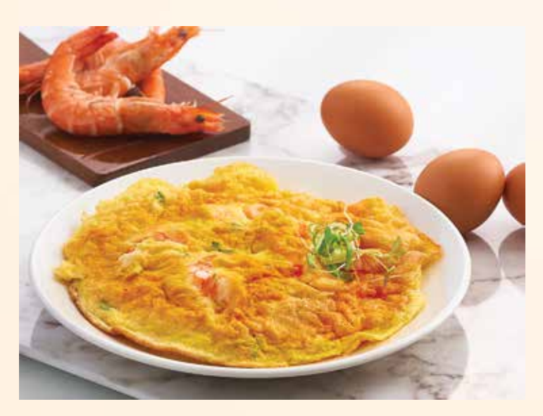
46.虾仁煎蛋 Fried Egg w/ Prawn