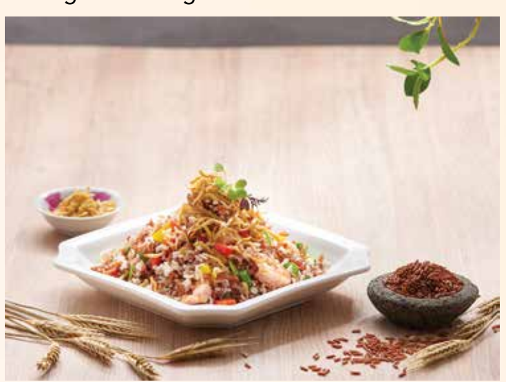
62. 虾仁蛋白糙米炒饭 $13.80 Fried Brown Rice w/ Prawn & Egg White