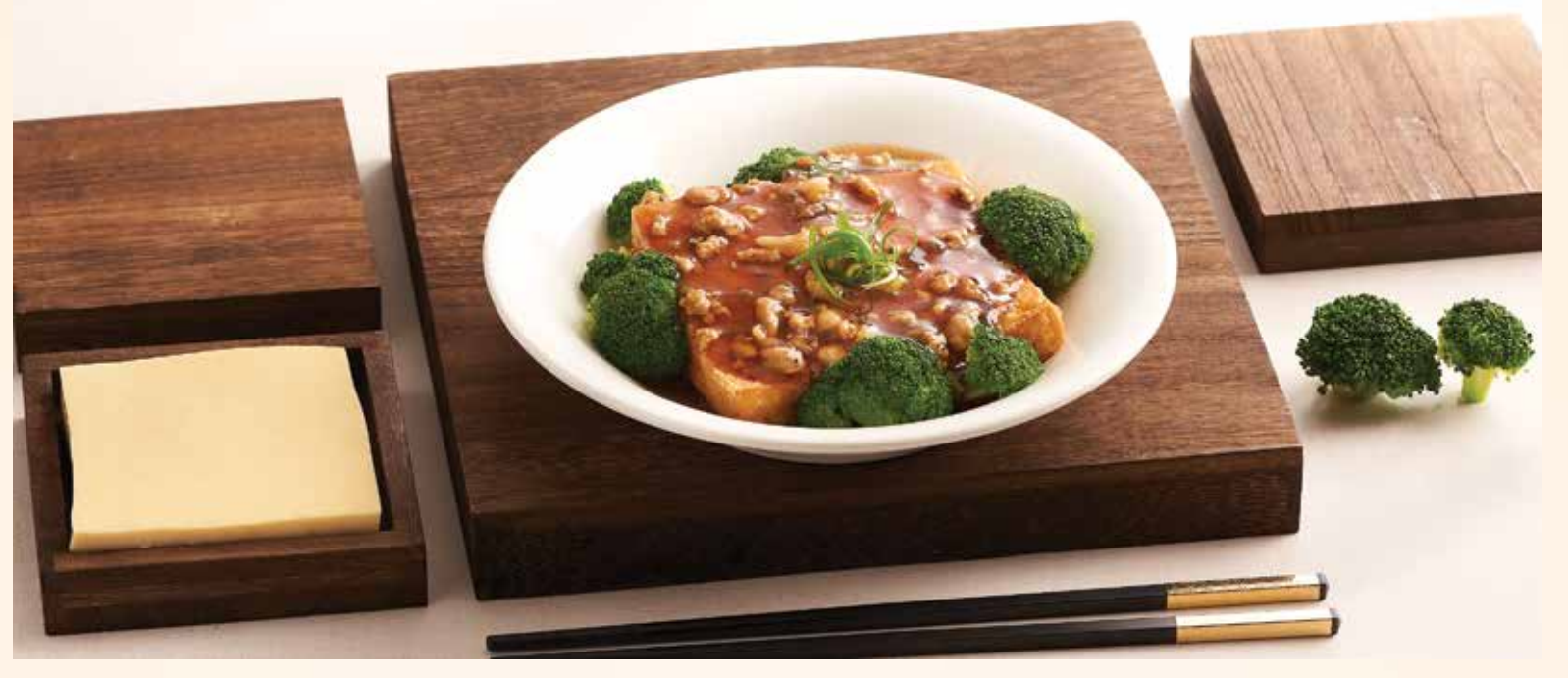
49.招牌互腐 Handmade Crispy Tofu w/ Minced Meat