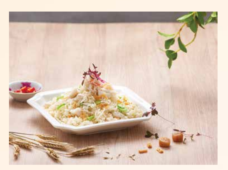
61. 蟹肉干贝炒饭 $16.80 Fried Rice w/ Crabmeat & Dried Scallop