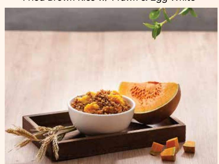
64. 金瓜饭 Pumpkin Rice