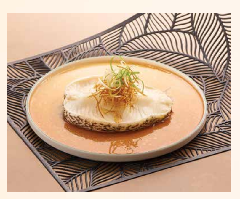
39. 港式鳕鱼 Cod Fish in Superior Soy Sauce