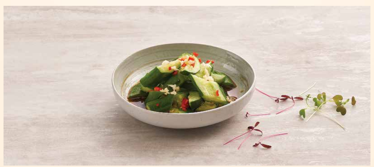
11. 蒜香黄瓜 $5.80 Japanese Cucumber w/ Garlic Chilli Vinaigrette