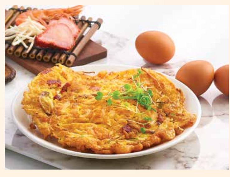
47. 芙蓉煎蛋 Fried Fu Rong Egg