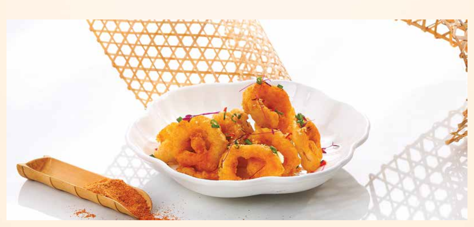
58.炸鱿鱼 Deep Fried Squid