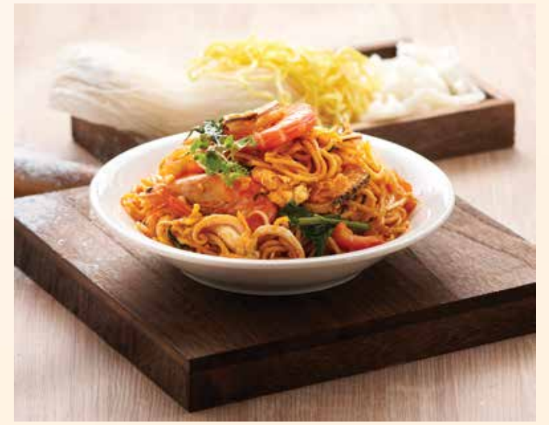
$13.80 70.海鲜马来炒面 Seafood Mee Goreng