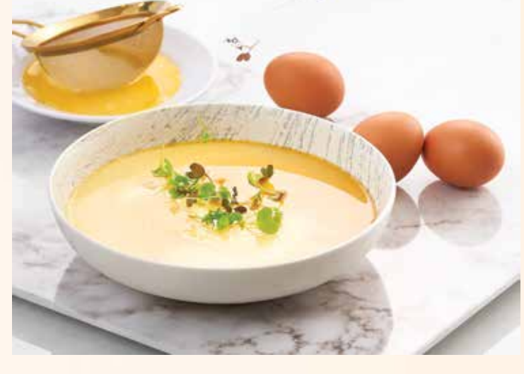
45.OMEGA 3 蒸蛋 Steamed Omega Egg