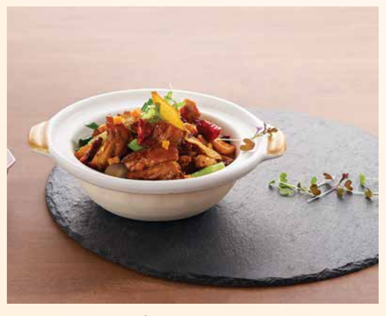
29. 咸鱼五花内腐煲 Claypot Pork Belly w/ Salted Fish