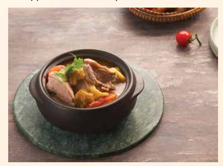
8. 老火咸菜鸭汤 Salted Vegetable Duck Soup