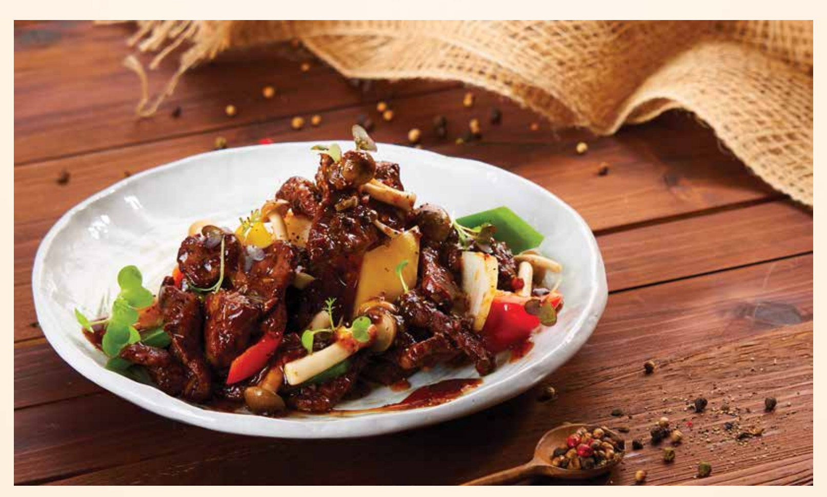
36. 黑胡椒炒鹿內 Venison Stir Fried in Black Pepper Sauce