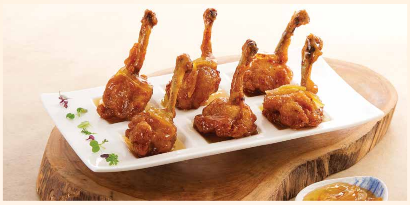
32. 蜜糖炸小腿 $15.80 Honey Glazed Drumlets