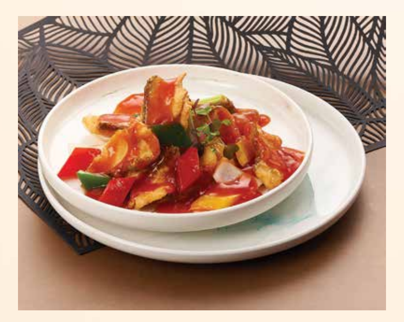
41. 酸甜鱼片 Sliced Fish in Sweet Sour Sauce