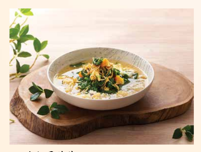
54. 金银蛋苋菜 Trio Egg Poached Spinach in Superior Stock