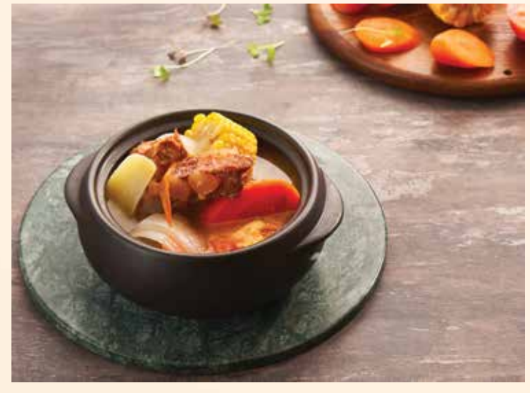
7. 老火ABC 汤 ABC Soup