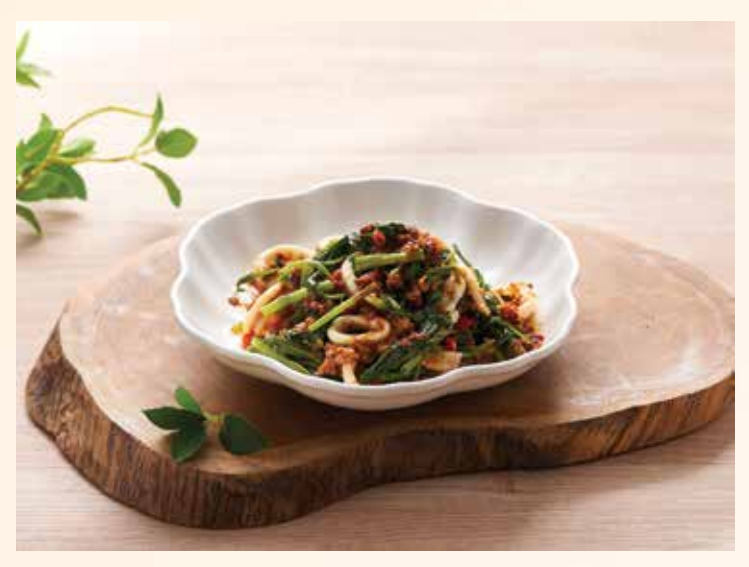
52. 鱿鱼蕹菜 Kangkong w/ Squid Choice of: 蒜蓉清炒 Garlic Stir Fry 辣椒 Sambal