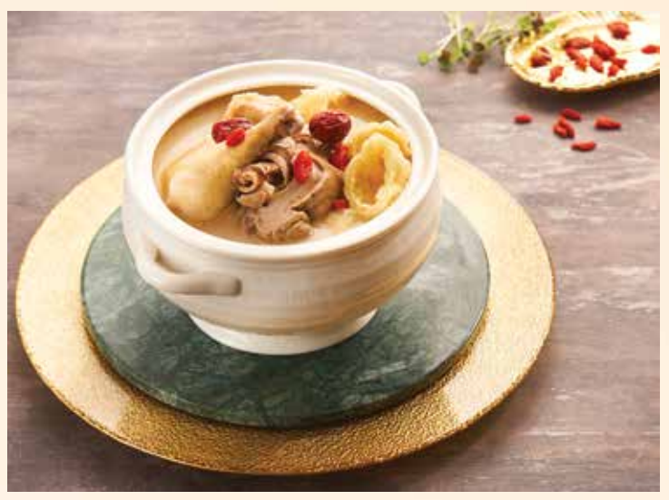
2. 老火鱼鰾豬肚鸡汤 $18.80 Fish Maw Pig Stomach Chicken Soup