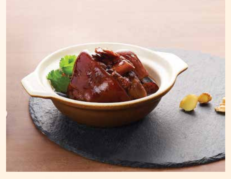
30.猪脚姜醋 Pork Trotter w/ Black Vinegar