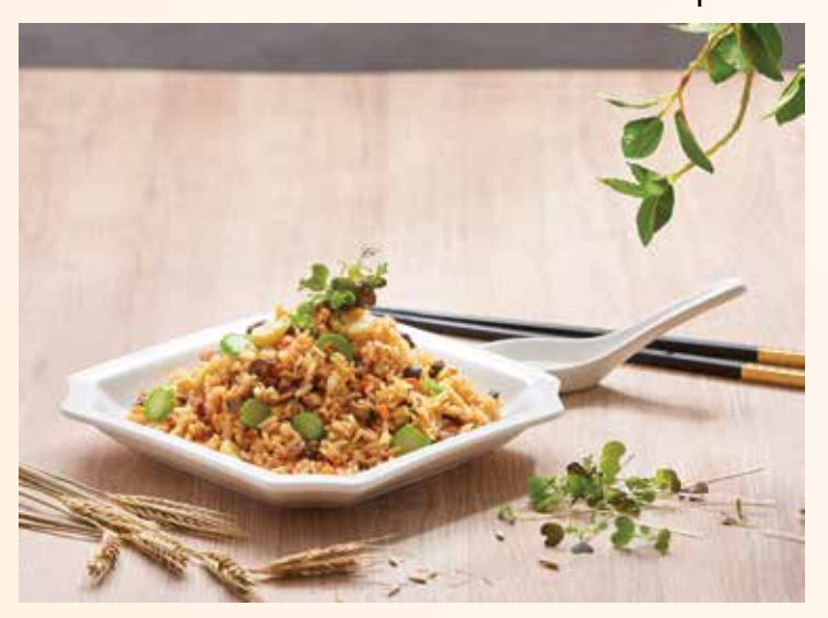
63. 素丁炒饭 $12.80 Vegetarian Fried Rice