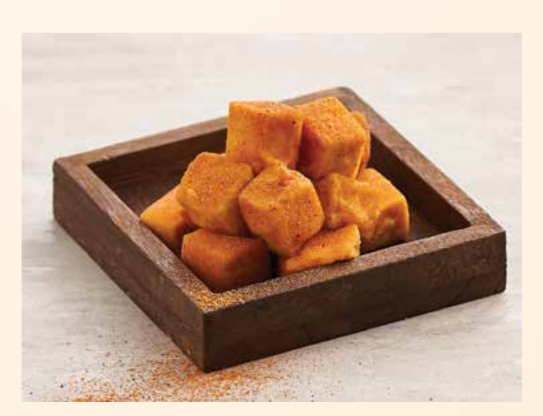
18. 脆皮椒盐豆腐 Crispy Tofu w/ Salt & Pepper