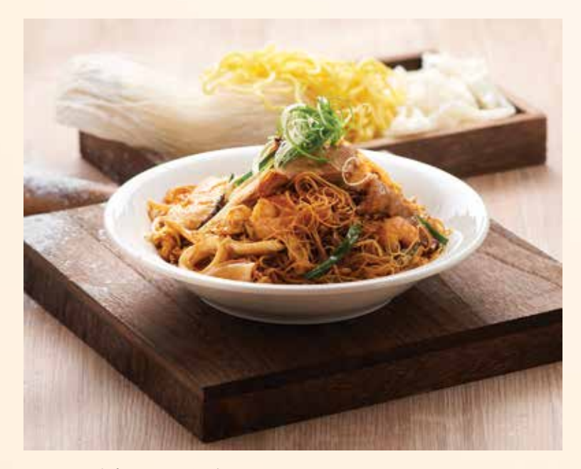
69. 星洲猪肚米粉 Sin Chow Bee Hoon w/ Pig Intestine